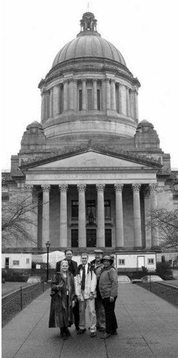
WASHINGTON 2004. House Bill 2645. NAC and friends at the State Capitol in Olympia.