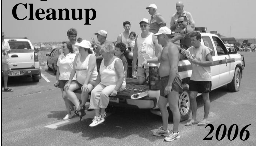
A scene from the 2005 edition of the annual event.