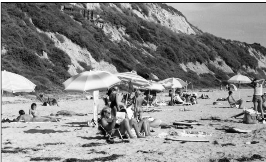
Barer times. A Santa Barbara Beach in 1992.